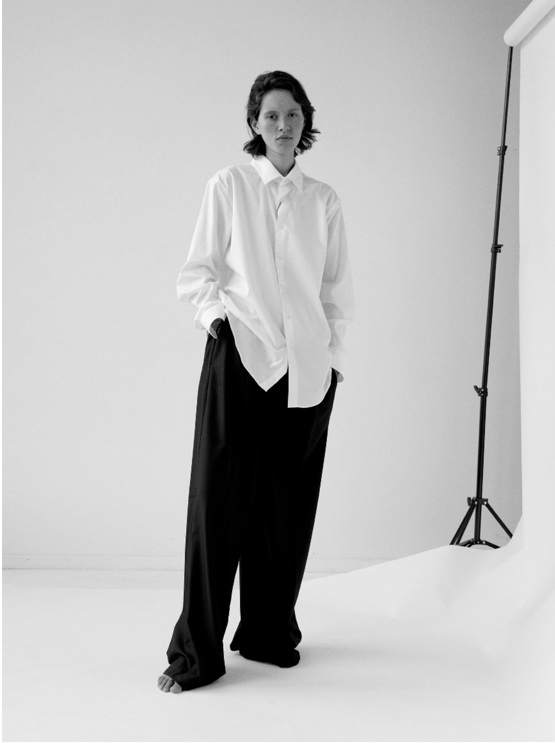
180 | 82-57-88 | SHOES 41 | BROWN EYES | DARK BROWN HAIR