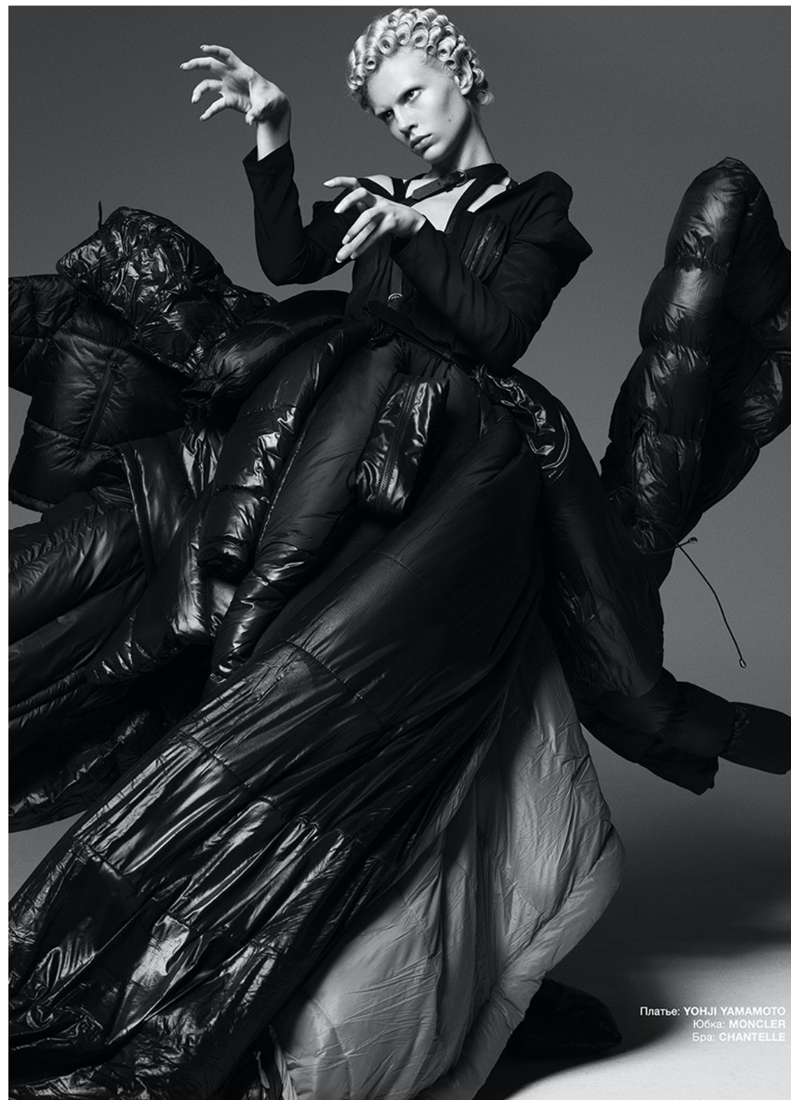
Платье: YONJI YAMAMOTO Юбка: MONCLER Бра: CHANTELLE