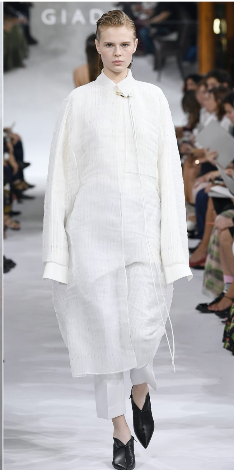
ALEXANDER MCQUEEN | BALMAIN | GIADA